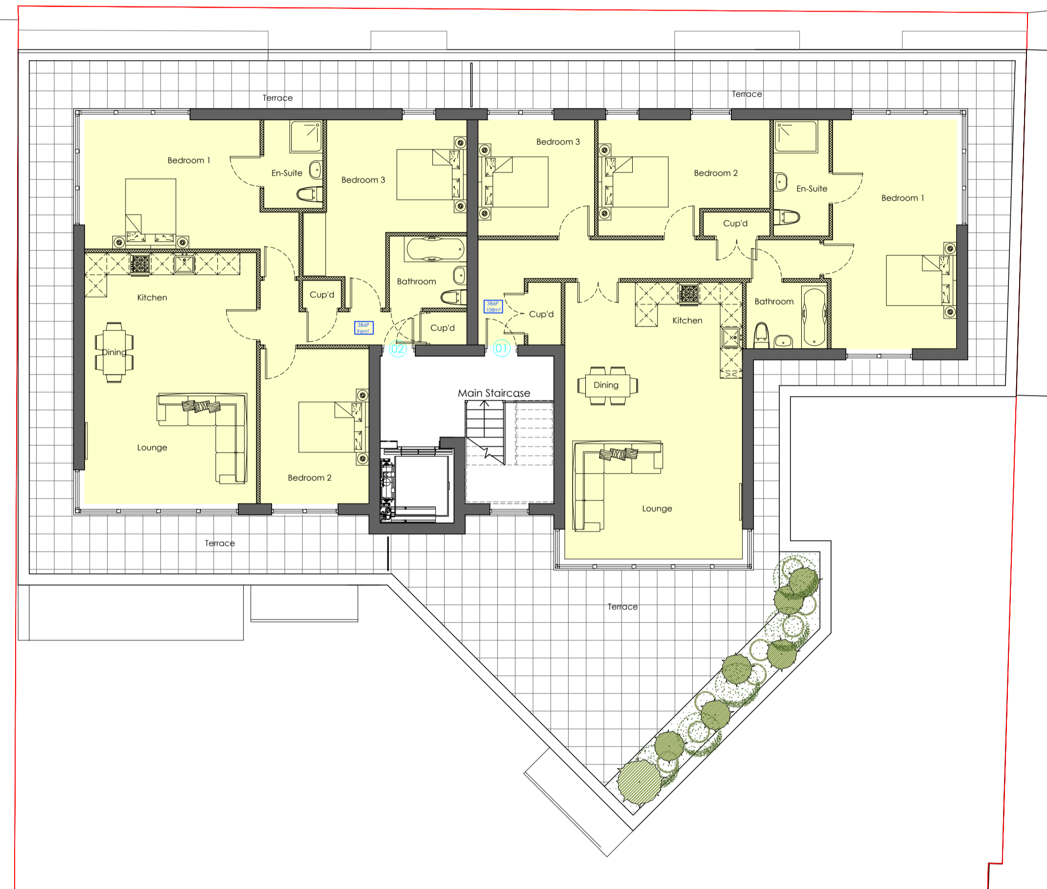
1 Proposed Fourth Floor plan

Do not scale this drawing. Work to figured dimensions only. This drawing is copyright of APS Designs and should only be reproduced with their express permission. Check all dimensions on site. Any discrepancies should be reported to APS Designs prior to commencement.